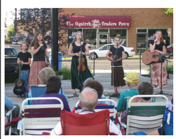
The group "Wildflowers" performed bluegrass music before a crowd at Fridays on Vine earlier this year.

The Tooele City Arts Council and the Tooele Downtown Alliance would like to thank you for your support with Fridays on Vine. Entertainment this year included a great variety of music and performers, including Polynesian island dancing and a ventriloquist!